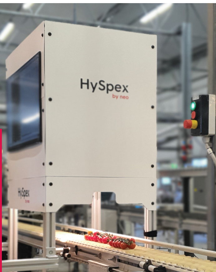
Figure 1: A compact HSI solution comprising hyperspectral instrumentation, illumination, and real-time quality grading output on an integrated screen. This image is from an early-stage demo setup at the customer site.

The system is designed to handle 40 trusses per minute, which is matching the speeds with which 2-4 trained operators can cut and sort the trusses.